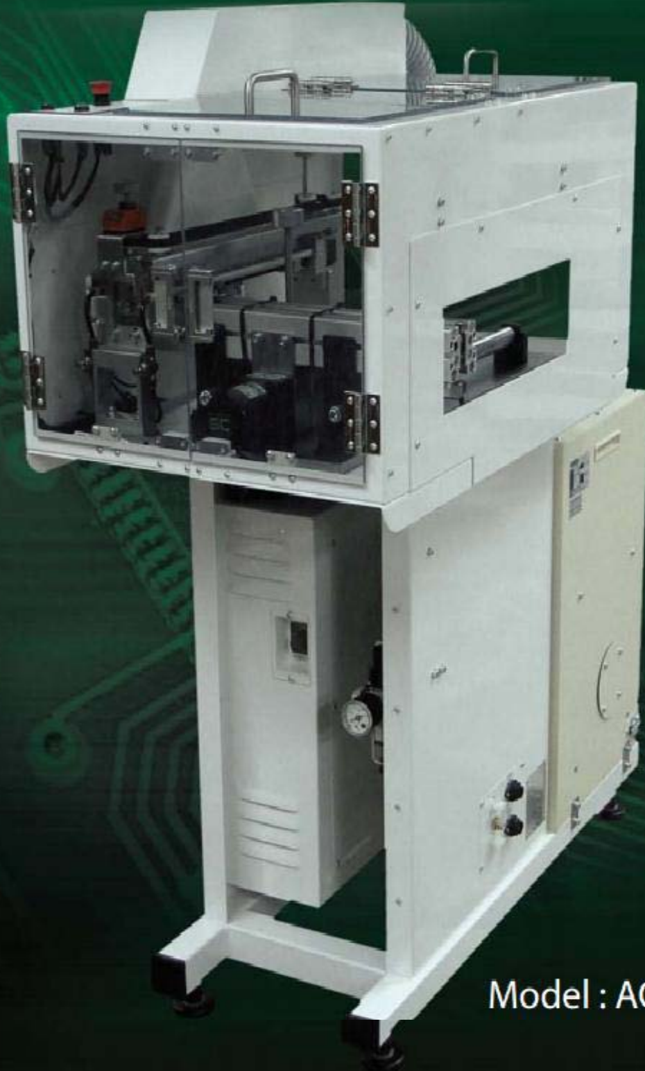
Model : ACS - 1000

ANTISTATIC BRUSH CLEANING SYSTEM WITH DEIONIZE ZONE